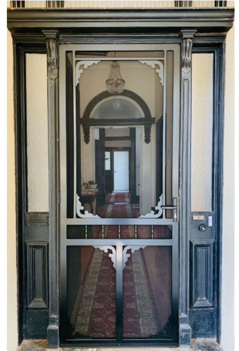
Beautiful screen doors made by Koby Ashcroft.