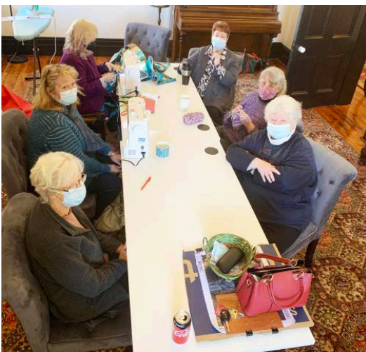
Happy quilters! (They're all smiling behind the masks!)

D uring lockdown, none of our groups will be meeting of course, but here's a little window into how our amazing Patchwork and Quilting Group was meeting up before increased restrictions were put in place.