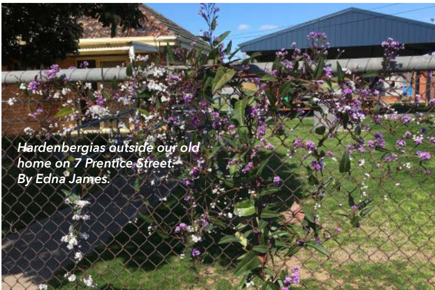
Hardenbergias outside our old home on 7 Prentice Street.