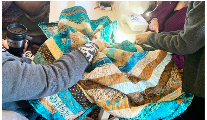
A beautiful quilt in turquoise and brown, being completed by Wendy Cook.