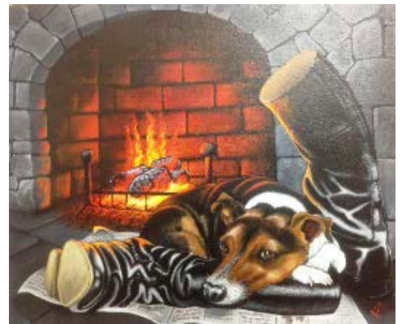
A couple of examples of Amanda Hocking's painting styles.