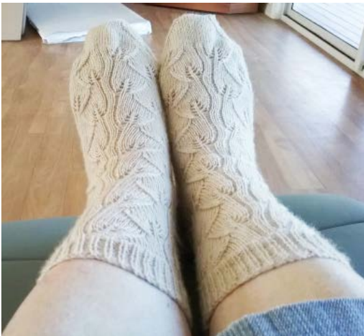
A pair of socks done by Beryl Dukes.