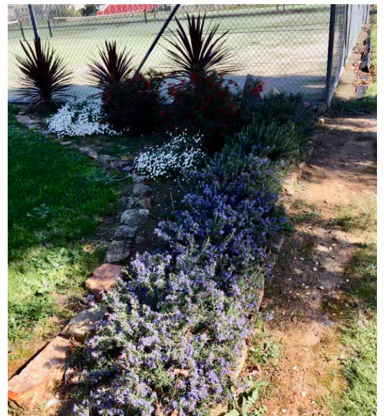
7 Prentice Street.