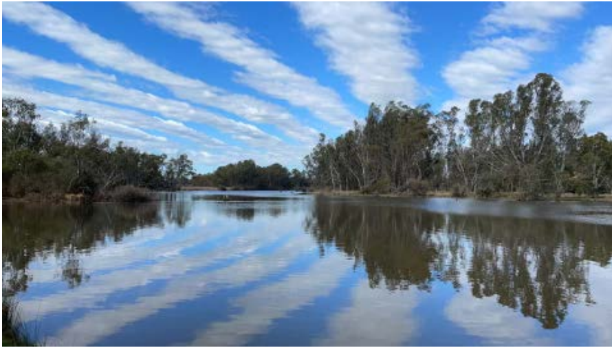
Picnic point near Kirwans Bridge 21/8, 11.00am in the morning.