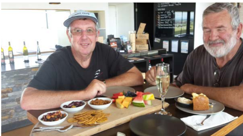
Enjoying a nice meal after the walk.